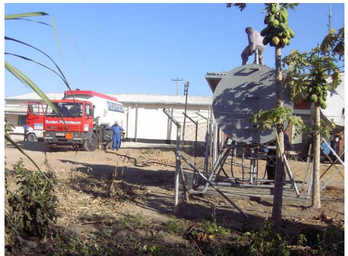
New diesel tank being filled for the first time

Since fuel situation remains critical and uncertain, Murambinda would like to make contingency plan for dry spells by buying in bulk.