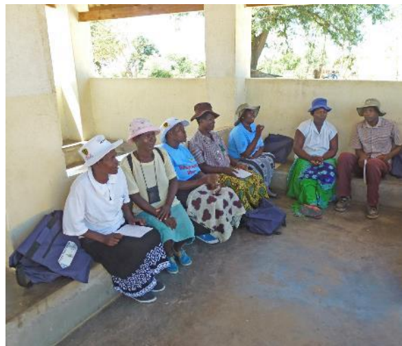
Community Health Care workers at Murwira Rural Health Centre

Encouraging signs were the presence of Zimbabwean doctors, the continuing dedication and resourcefulness of nursing staff, the success of the nurse training school and the inspirational Child and Adolescent Resource Centre supporting children with HIV.