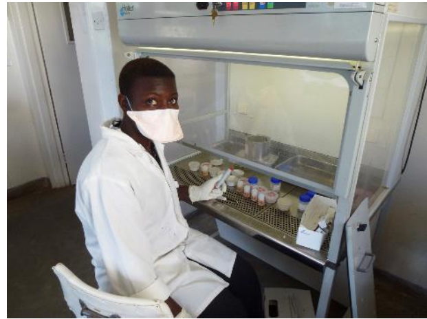
Equipment threatened by lack of servicing