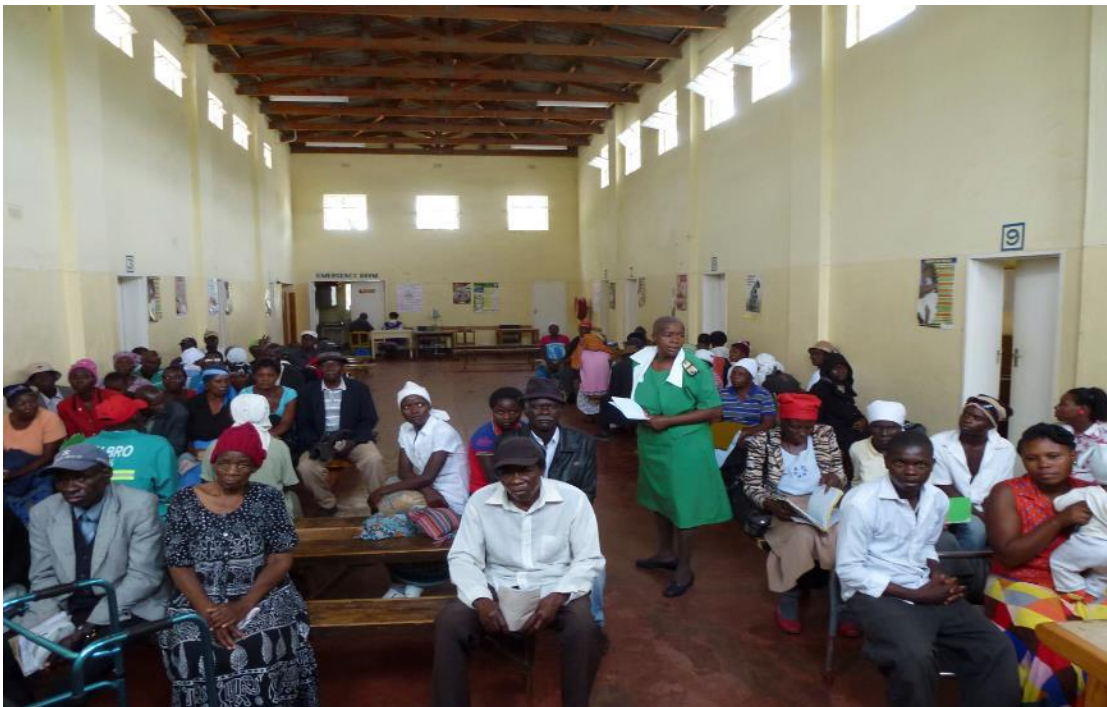
Murambinda Mission Hospital Outpatients Waiting Room 2016