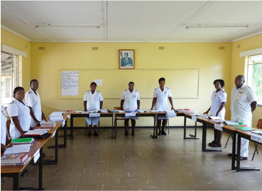
Murambinda Mission Hospital Nurse Training School 2016