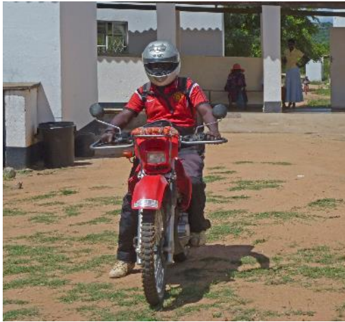
A Rider for Health

district have been severely affected by the withdrawal of MSF financial support. Use of vital but expensive laboratory equipment is threatened by lack of reagents and equipment servicing contracts. Transport of specimens and test results provided by Riders for Health is also in danger of being lost. Community Health Care Workers are vital to TB case detection and treatment follow up in the community where affordable transport is limited.