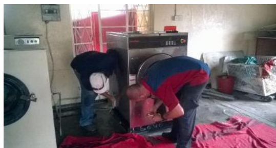
A welcome replacement laundry machine