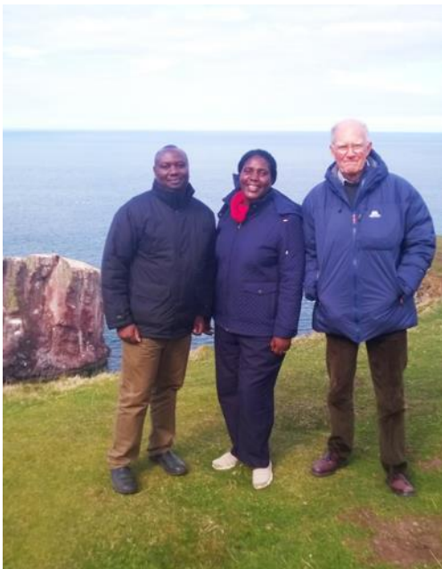
St Abbs Head, Berwickshire.