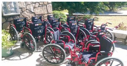
New wheelchairs at last.