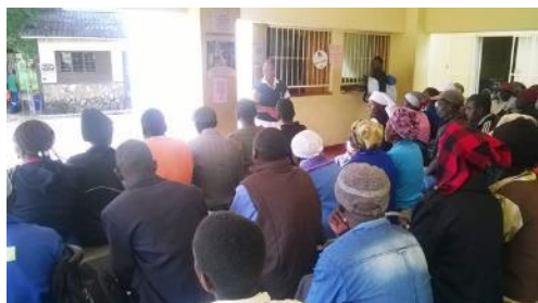
Health education in OPD