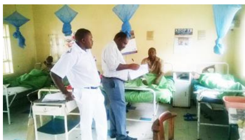
A ward round