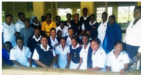
The School of Midwifery