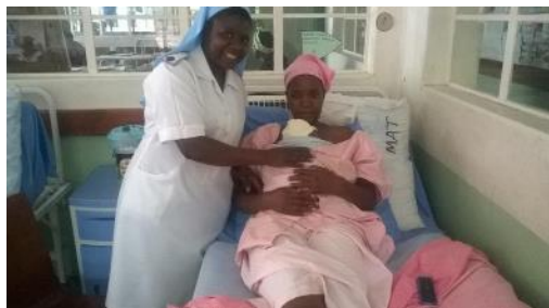
Kangaroo care in the maternity ward